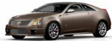
MOCHA STEEL 2